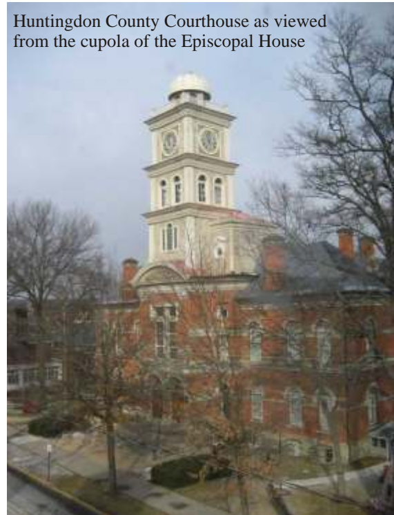
Huntingdon County Courthouse as viewed from the cupola of the Episcopal House

Finally, nearly 250 churches, and a synagogue are located in the county. Many churches within Huntingdon, including St. John's, are members of the Huntingdon Forum of Churches and work together on community projects and seasonal church events.